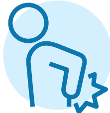
New or worsening pain