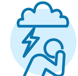
Mental health concerns such as low mood, anxiety or depression