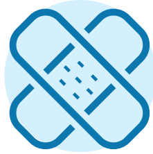
Cuts, wounds or skin conditions