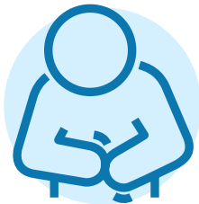
Nausea, diarrhea and constipation