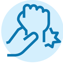
Sprains and strains

Your family doctor or nurse practitioner knows your health-care needs the best, but if you can't see them, visit the UPCC for same-day, urgent care for non-life-threatening health concerns.